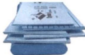
STYROFOAM™ Brand Foam BLUE™ Board Insulation