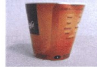
paper wrapped foam